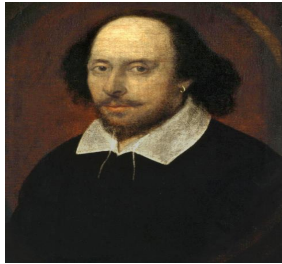
A portrait thought to be of William Shakespeare, from around 1600.

Some of the phrases that Shakespeare wrote have become a part of our everyday language!